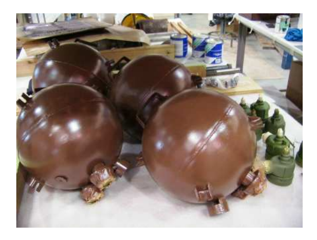
Figure 2: Bombs? No, just freshly painted fire extinguisher canisters