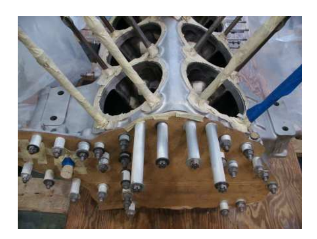
Figure 7: Merlin engine block ready for cleaning