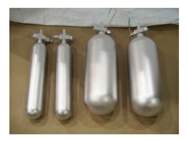
Figure 10: The finished product