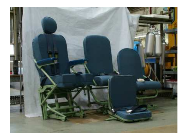
Figure 5: Upholstery by Kessels