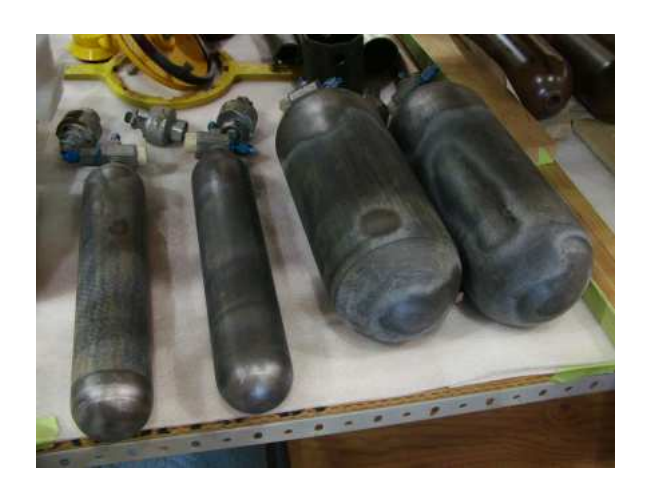
Figure 9: Fire suppressant cylinders ready for painting