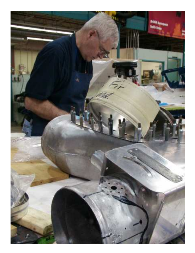
Figure 3: Penney for a thought